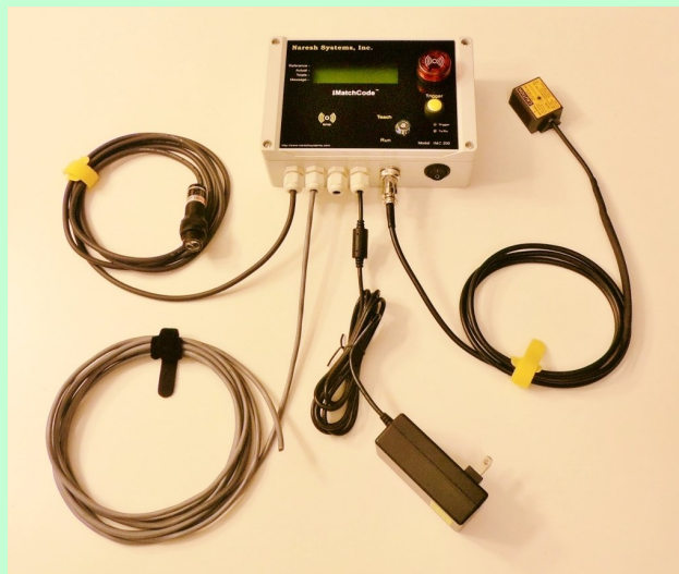
Complete Turnkey Barcode Verification System

Accurate labeling is critically important to your business!